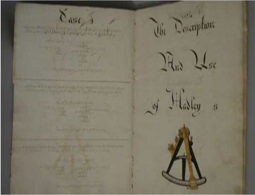
359. NAUTICAL WORK BOOK INCLUDING "THE DESCRIPTION AND USE OF HADLEY'S QUADRANT", early 19th Century, including various navigational and mathematical problems illustrated in watercolors.