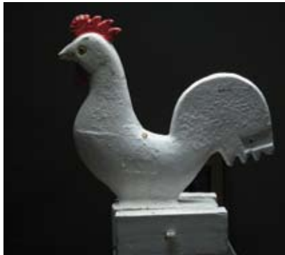
337. AMERICAN ROOSTER COUNTERBALANCE MILL WEIGHT, 19 th Century, cast iron. Height 19 in. Width 18 in.