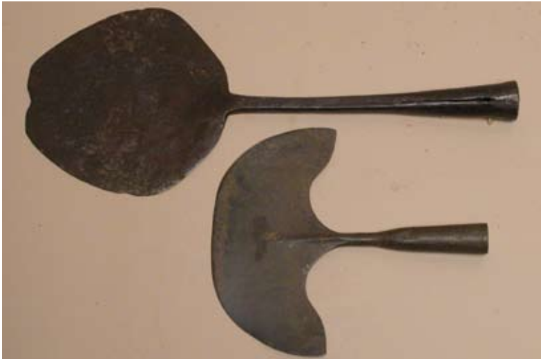
343. 19TH CENTURY WHALE BLUBBER AND BONE SPADE.