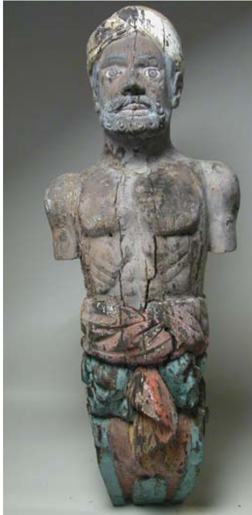
336. CARVED FIGUREHEAD OF TURK WEARING TURBAN. Height 70 in.