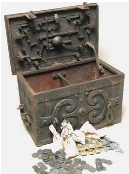
340. 17 TH CENTURY SPANISH ARMADA STRONG BOX. Height 16 in. Width 28 in. Depth 17 in.