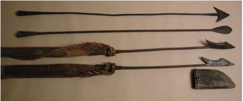
345. 19 TH CENTURY DOUBLE FLUE HARPOON.