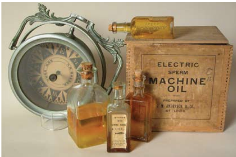
338. "TELL-TALE" COMPASS, late 19 th Century, in green patina, the card is marked "N.R. Holzer, New York".