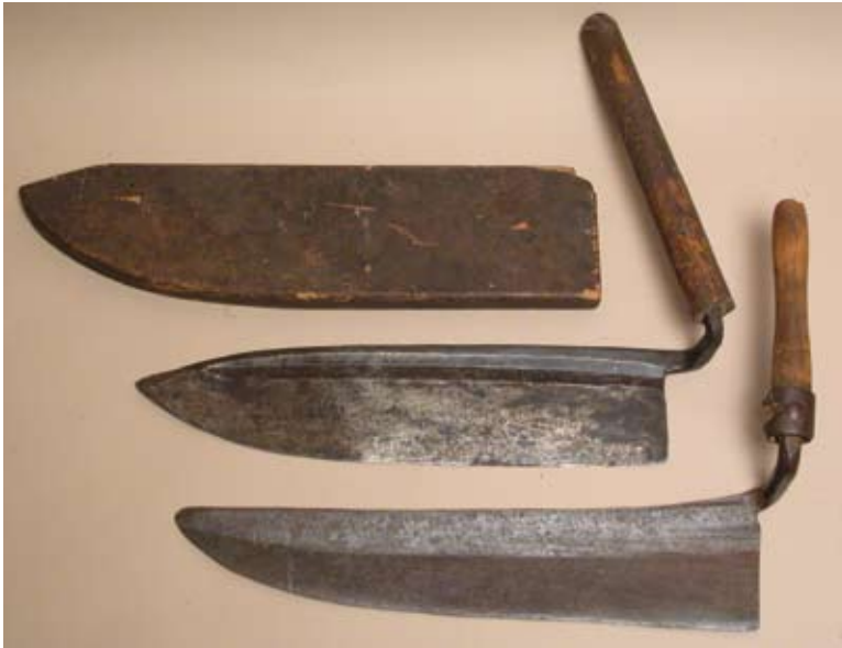
353. SIGNED WHALE BLUBBER CUTTER, 19 th Century, with wood sheath. Length 20 in.