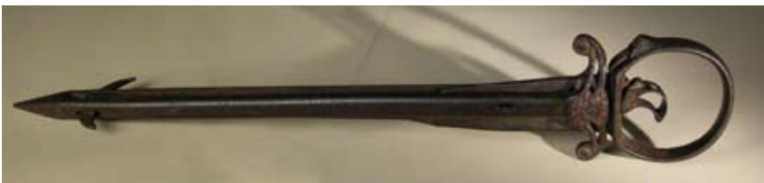
352. CAST IRON WHALE HARPOON, 19 th Century.