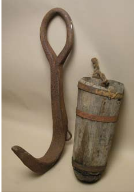
341. SCARCE IRON WHALE BLUBBER HOOK, circa 1850. Length 39 in.