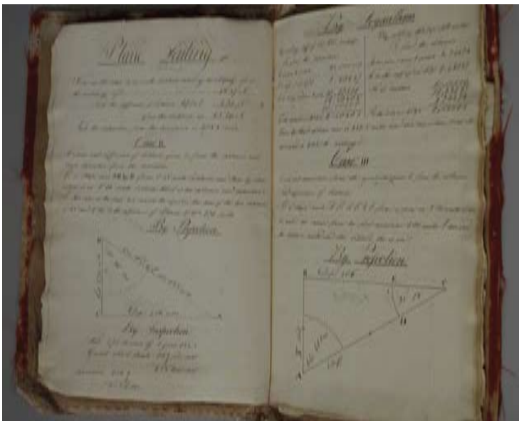
355. STUDENT'S NAVIGATIONAL WORK BOOK, early 19 th Century, inscribed on cover "Holton P. Haskell, 1827" with mathematical, geometrical, and plain sailing problems and drawings.